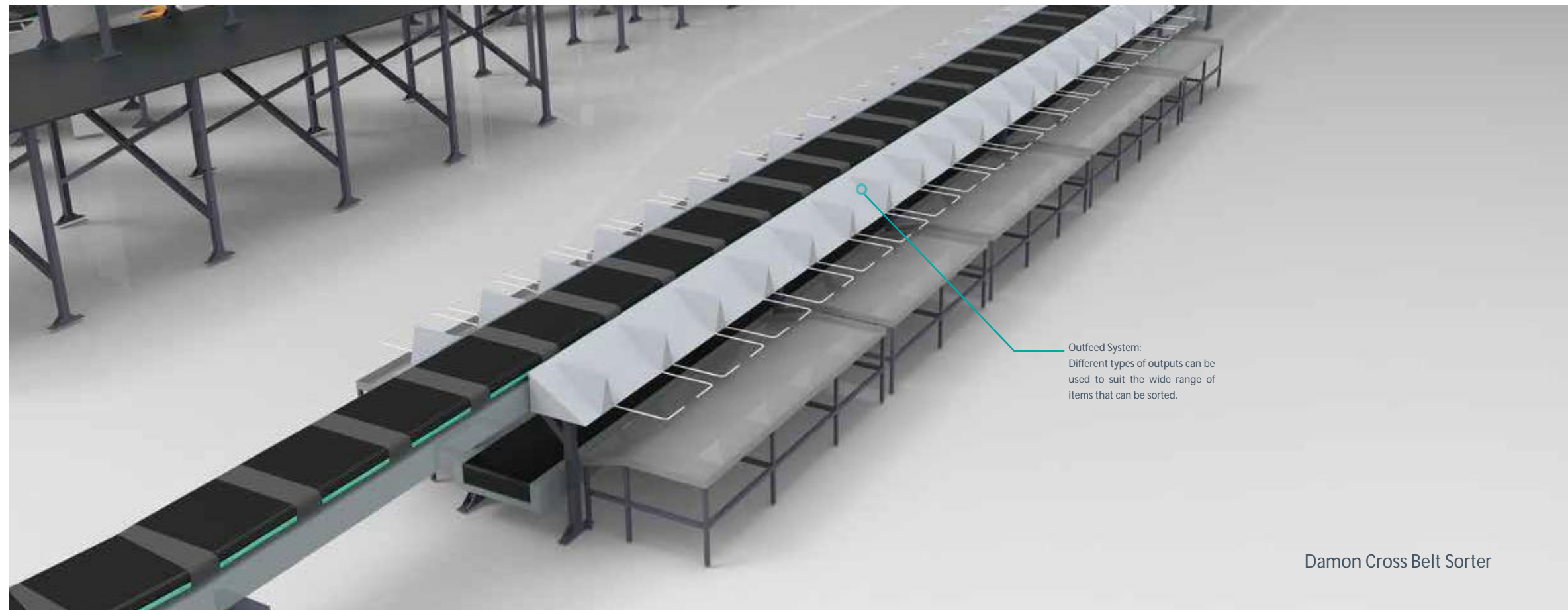
Damon Cross Belt Sorter