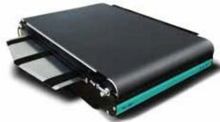
Cross belt servo motorized roller direct drive technology