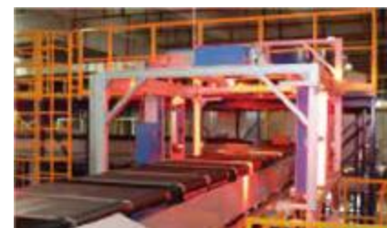
Camera barcode recognition system

Introducing technology with an industrial design for modular construction and fast assembly and disassembly. This results in extremely easy maintenance and the ability to change a cross belt vehicle within only 5 minutes.