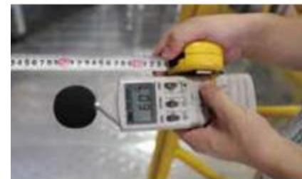
High speed, low noise